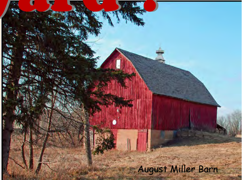
August Miller Barn