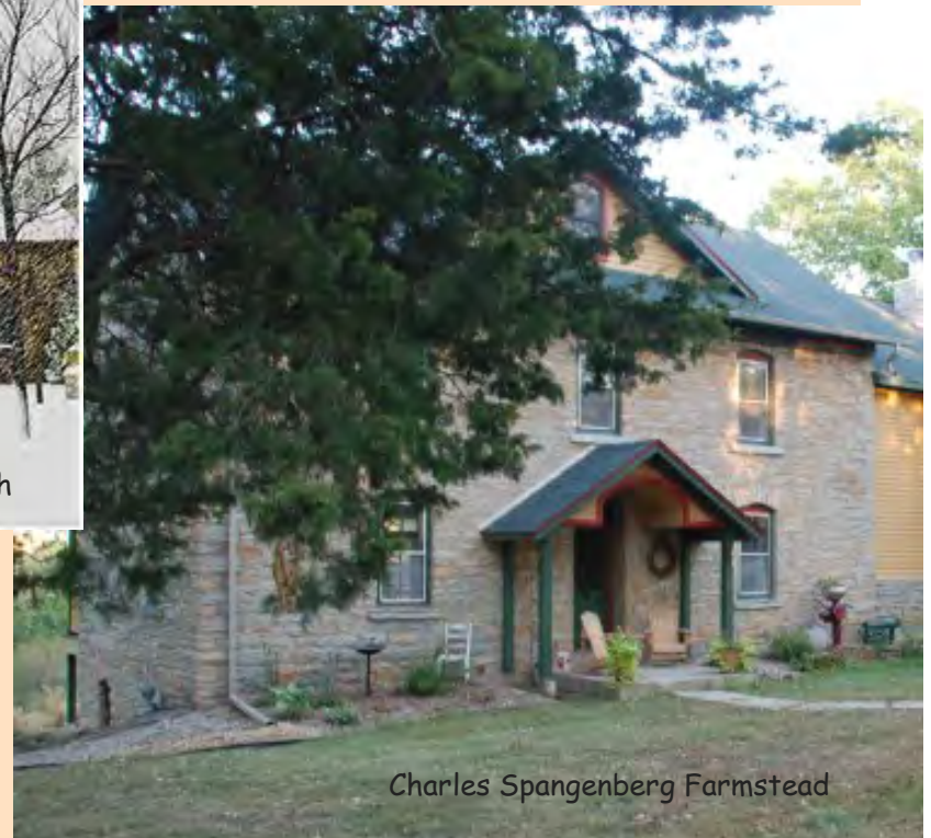
Charles Spangenberg Farmstead

Presented by the Woodbury Heritage Society in observance of Woodbury's 50th Anniversary as a city. Discover and learn about Woodbury's rich history from the glacier age, through the rein of Chief Little Crow to the arrival of the Europeans. Twelve notable sites will be